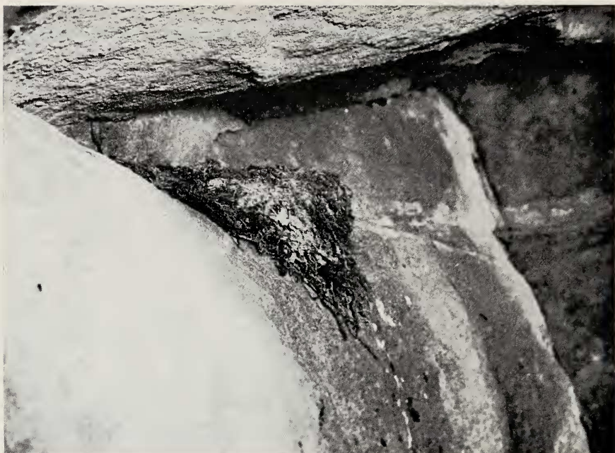
FIG. 1. Typical Black Swift nest site.

go on to the upper falls. Upon reaching the base of the lower falls we flushed a bird from a nesting hole in the rock. By climbing part way up the side of the gulch we were able to see the nest. It was about 15 feet above the pool at the base of the falls on the sheer side of the gulch and about seven feet from the falling water. The pocket in which the nest was located was about one foot wide, 10 inches high, and 10 inches deep. It appeared to have been constructed of moss and mud and the layering indicated several years of use. In the nest was a single white egg. This then was the first nest and egg of the Black Swift to be found in Colorado and vindicated Drew's assumption that the bird bred in Colorado.